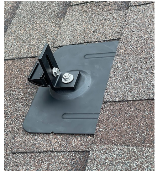
L-Foot mount is sold separately